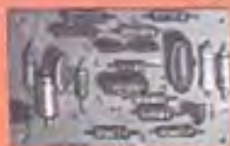
Preampifier PC Board.