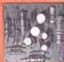
Driver PC Board.