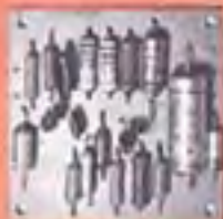
Phono Input Amplifier PC Board.