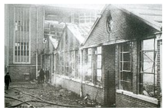
Factory fire: the remains of the Garrards factory after the 1958 blaze - still Swindon's biggest fire

Assembly lines for record changers, inspection areas and the despatch block were badly damaged or completely destroyed.