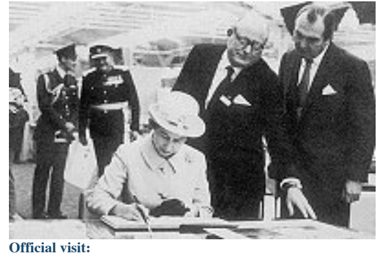
Official visit: the Queen signs the visitors book at Garrard's in 1971

This is a good point to stop and take stock of how far the company had come - and how far it would soon fall.