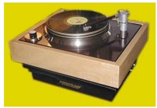
Lasting legacy: The Garrard name lives on and are still produced by a specialist company in Lambourn. Model shown here a Garrard 501.

Garrard's also had a sports ground to rival British Rail's in Swindon - now lost under part of the Greenbridge complex but commemorated in a road name, Garrard Way.