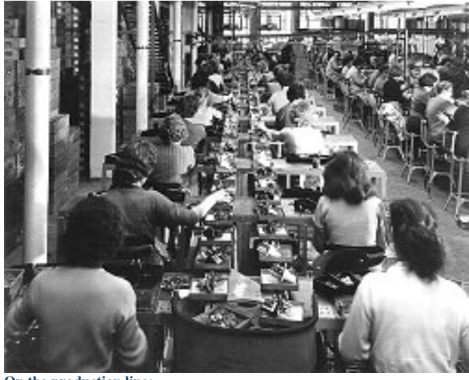
On the production line: Garrard provided work for thousands of Swindon women in the 50s, 60s and 70s

A large proportion of its workers were women, and although most of these were engaged in lower-grade and lower-paid production line work, Garrard's provided opportunities for women that their Swindon grandmothers - and in some cases their mothers - could not have dreamed of.