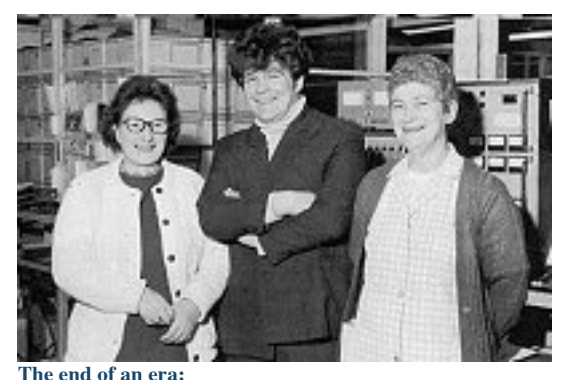
Garrard's laid off the last of its workers in 1982

In 1979 Garrard's was sold to a Brazilian firm, Gradiente, for a nominal fee, and in 1982 production in Swindon ceased altogether - the last 179 jobs out of more than 4,500 less than ten years earlier, finally axed.