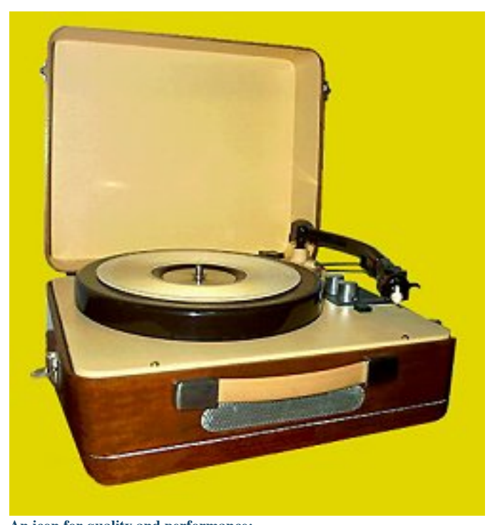
An icon for quality and performance: A Swindon-made Garrard turntable

Like the GWR, Garrard was a byword for quality and excellence, and its reputation was global. And, like the GWR again, just the mention of the name is still sufficient to